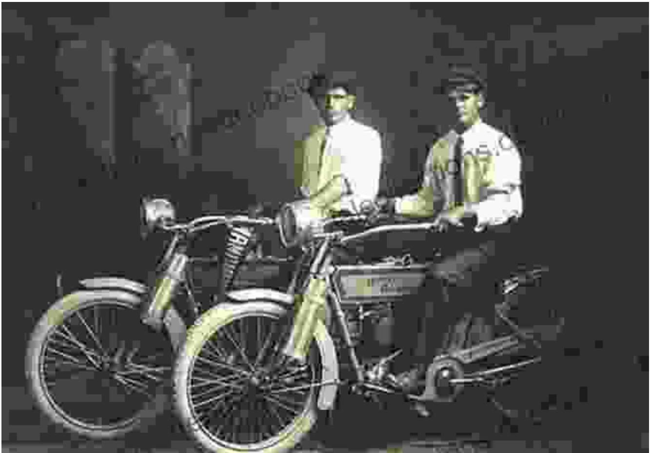
William S. Harley, inventor of the Harley-Davidson bicycle

1903, Harley designed a new type of bicycle frame that was lighter and stronger than previous designs. He also developed a new type of coaster brake that was more efficient and reliable than Schwinn's coaster brake. Harley's inventions helped to make bicycles more popular and accessible, and they laid the foundation for the success of the Harley-Davidson Motor Company.