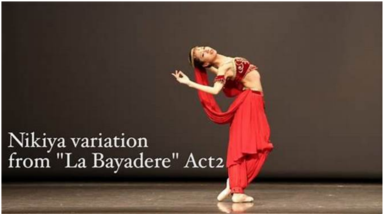
Nikiya Variation from La Bayadère by Marius Petipa

Nikiya, the temple dancer in La Bayadère, exudes exoticism and passion. Her variation, known for its intricate footwork and expressive arm gestures, showcases her vibrant □□□□□□ cultural heritage. The ballerina's rapid pirouettes and dynamic leaps embody Nikiya's fiery spirit and devotion.