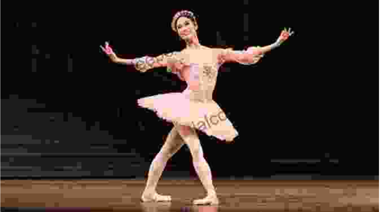
Aurora Variation from Sleeping Beauty by Marius Petipa

Aurora, the princess in Sleeping Beauty, embodies elegance and grace. Her variation, known for its sweeping adagios and lyrical arm movements, portrays her serene and noble lineage. The ballerina's graceful extensions and refined poise evoke Aurora's dreamlike state and enchanting presence.