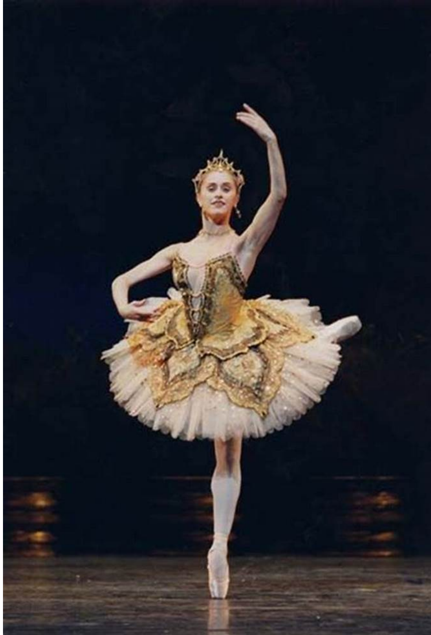
Gamzatti Variation from La Bayadère by Marius Petipa

Gamzatti, the haughty princess in La Bayadère, represents arrogance and jealousy. Her variation, filled with sharp turns and elevated balances, portrays her regal demeanor and disdain. The ballerina's precise footwork and imperious gestures convey Gamzatti's cold-hearted and ambitious nature.